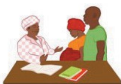
Parents receive the planner