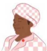
Healthcare workers are trained

In collaboration with our partners, we support the Ministry of Health of Burkina Faso in implementing training for healthcare providers on the Birth and Emergency Preparedness Plan (BEPP) and in producing planners for 9 out of 70 health districts. To expand this initiative so that every pregnant woman in Burkina Faso can receive adequate advice on her pregnancy, financial support is still needed.