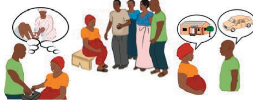
The planner sparks discussions within the family