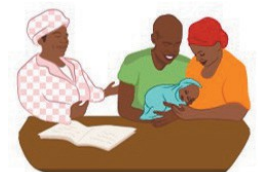
Childbirth takes place safely at the health center.