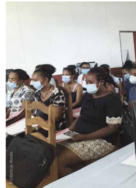
Pilot project in Madagascar, where around a hundred doctors, nurses and midwives were trained to show respect towards women and their babies during healthcare.

In Burkina Faso, the principles of health promotion set forth by Enfants du Monde are now included in the initial training programs for midwives, nurses and community health workers at the National School of Public Health.