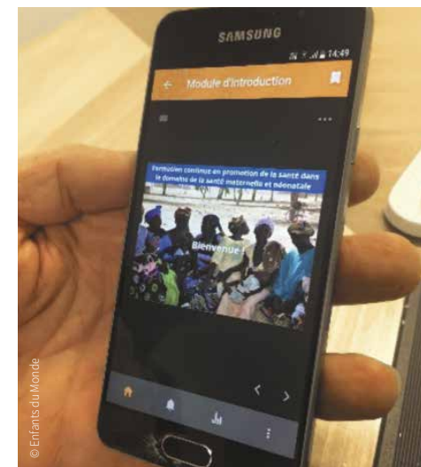
In Burkina Faso, we have started a process leading to the broadcast of our online training programs for care providers on a national level.