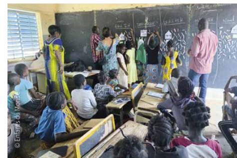
In Burkina Faso, the children identified health problems and the solutions to them.

Enfants du Monde organises community participating diagnosis sessions. The wives, husbands, traditional medicine practitioners, local community leaders identify, with the health staff, a number of health problems and their solutions, which are then integrated in the health centres' plans of action.