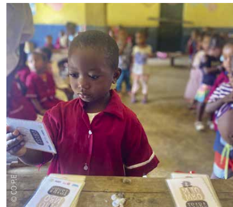
In order to prevent malnutrition, Enfants du Monde has developed different coursebooks and games so that teachers can convey the principles of a healthy and nutritious diet to their pupils.

In Madagascar, to prevent malnutrition, we inform children, their parents and their teachers about the principles of a healthy diet using local products, thanks to educational play activities.