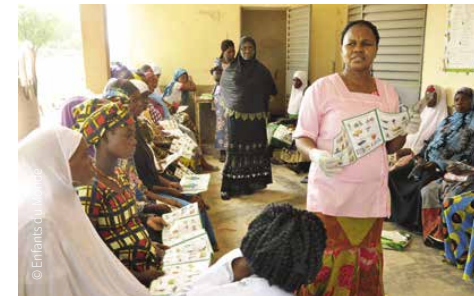
In Burkina Faso, our birth preparation and emergency card states what to do in the case of complications and stimulates the use of healthcare.

In Burkina Faso, to prevent home accidents, favour a healthy diet and stimulate the use of medical care, we inform the parents of 0- to 5-year-olds via a mobile app. Play activities are also held for older kids.