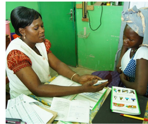
Antenatal consultation in Burkina Faso with the Childbirth Preparation Booklet and the PANDA application from Enfants du Monde.

We create adolescent-friendly educational materials and train facilitators and teachers to conduct participatory activities with young people to prevent teenage pregnancy.