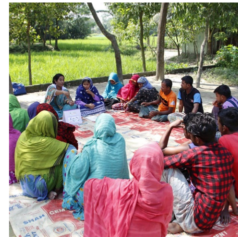
Health education session in a village, Bangladesh.

In schools, we train teachers and develop fun and educational activities to teach children and their parents about healthy and nutritious food based on local products, in order to prevent malnutrition and foster resilience.