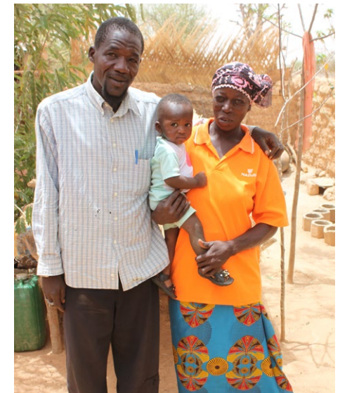
Couple who benefited from health education sessions, Burkina Faso.